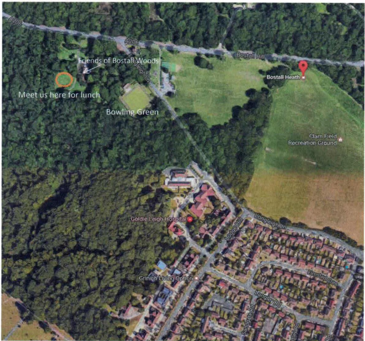
Map of Bostall Woods area: