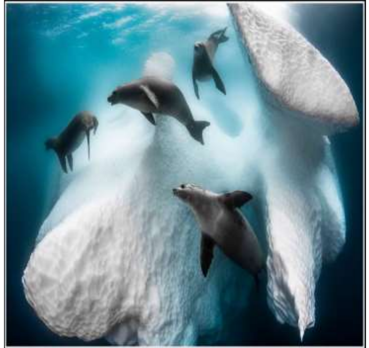
Pictured: The winning photograph, Frozen Mobile Home, showing crab-eater seals swirling around an iceberg in Antarctica, taken by Greg Lecoeur, taken from the Underwater Photographer of the Year Twitter page.

The Underwater Photographer of the Year 2020 has been announced. The competition celebrates photography beneath the surface of the ocean, lakes and rivers. More than 5,500 underwater pictures were entered in 13 categories by underwater photographers from 70 countries around the world. The images included ravenous sharks, a tiny Common froglet, swimming dragons and an octopus playing football. Greg Lecoeur won Underwater Photographer of the Year 2020 with Frozen Mobile Home , showing crab-eater seals swirling around an iceberg in Antarctica. Greg said, "Massive and mysterious habitats, icebergs are dynamic kingdoms that support marine life. During an expedition in Antarctica Peninsula, we explored and documented the hidden face of this iceberg where crab-eater seals have taken up residence."