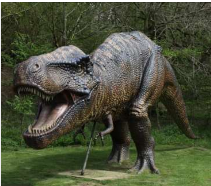
Pictured: A typical life size model of a dinosaur at Dinosaur Adventure, Norfolk.

Blair Drummond Safari Park near Stirling is celebrating its 50 th anniversary with a £1 million upgrade, this includes the installation of "World of Dinosaurs". Visitors will enter the new attraction through giant Jurassic Park-style gates and there will be more than 20 life-sized dinosaurs. The models, including velociraptors, a diplodocus and a T-Rex with a "terrifying roar", will be installed in a 1,000m 2 area of woodland. They are controlled with infrared sensors and make a range of noises and movements including blinking eyes, stomach breathing, moving bodies and heads. Park manager Gary Gilmour said: "The detail in our new dinosaurs is incredible. They're so life-like and we cannot wait to unveil them to visitors. The largest dinosaur is a 21m diplodocus, but the wow factor is the iconic T-Rex with its terrifying roar."